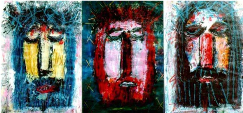
Face of Jesus Christ

Salvator Mundi: Via Crucis By Denise Levertov Maybe He looked indeed much as Rembrandt envisioned Him in those small heads that seem in fact portraits of more than a model. A dark, still young, very intelligent face, A soul-mirror gaze of deep understanding, unjudging. That face, in extremis, would have clenched its teeth In a grimace not shown in even the great crucifixions. The burden of humanness (I begin to see) exacted from Him That He taste also the humiliation of dread, cold sweat of wanting to let the whole thing go, like any mortal hero out of his depth, like anyone who has taken herself back. The painters, even the greatest, don't show how, in the midnight Garden, or staggering uphill under the weight of the Cross, He went through with even the human longing to simply cease, to not be. Not torture of body, not the hideous betrayals humans commit nor the faithless weakness of friends, and surely not the anticipation of death (not then, in agony's grip) was Incarnation's heaviest weight, but this sickened desire to renege, to step back from what He, Who was God, had promised Himself, and had entered time and flesh to enact. Sublime acceptance, to be absolute, had to have welled up from those depths where purpose Drifted for mortal moments.