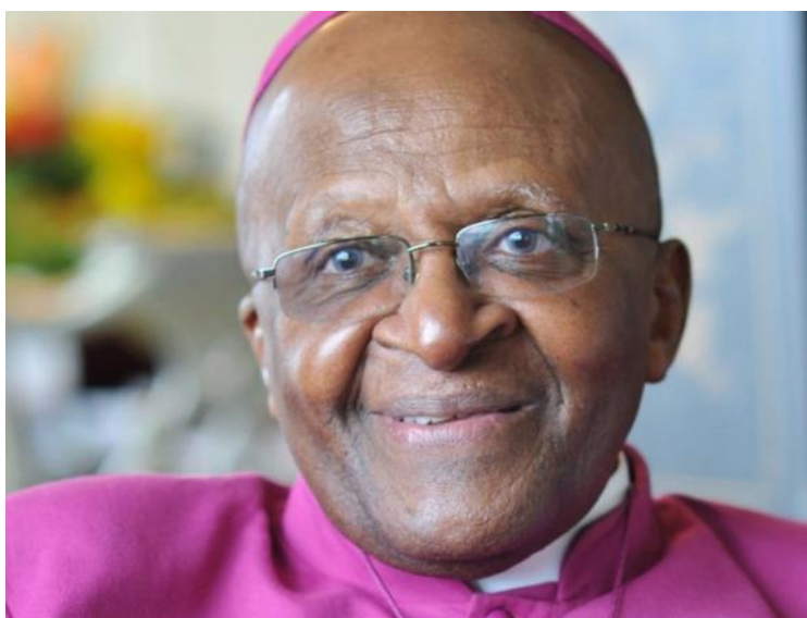
Desmond Tutu, 1931-2021

“Hope is being able to see that there is light despite all of the darkness.”