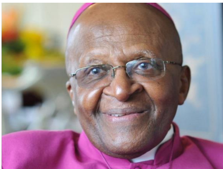
Desmond Tutu, 1931-2021

“Hope is being able to see that there is light despite all of the darkness.”